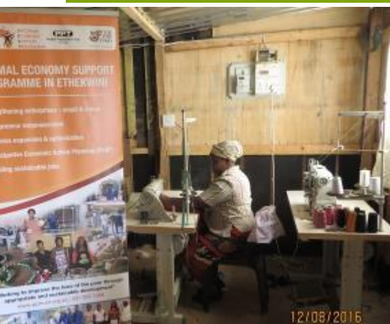
JPN Clothing manufacturing (above)

The entrepreneur responsiveness and participation in the IESP declined mainly because she is also being assisted by the Business Investment and Promotions Unit and Raizcorp for similar services.