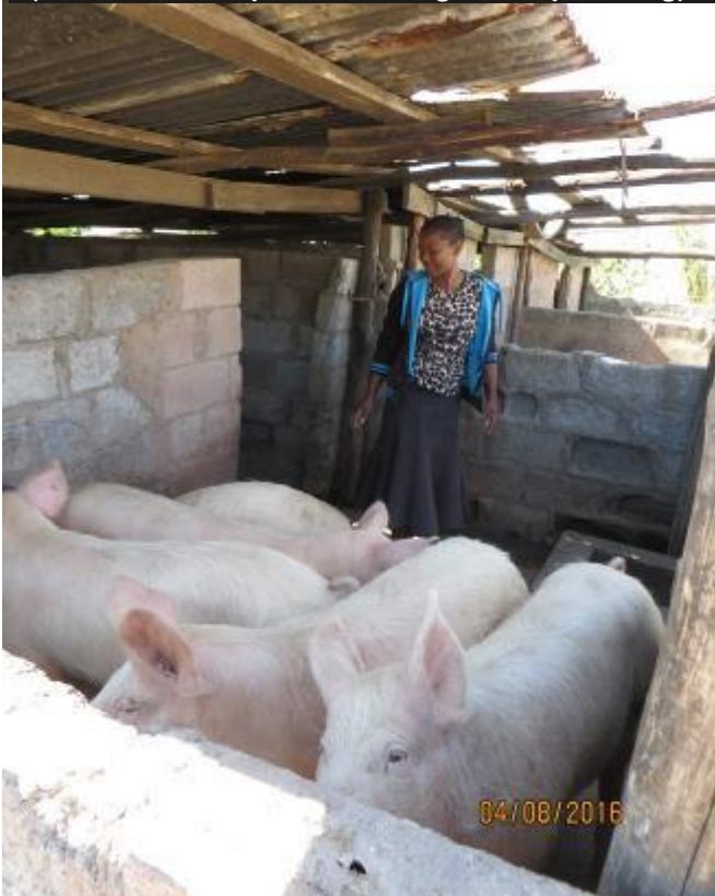
The farming activities of Georgesamo Co-operative (pigsty and chicken coop) and Vukaphansi Co-operative ( IESP mentorship visit showing the crop farming)

The PPT mentor assisted the enterprises in identifying challenges. This activity included the analysis of the viability and management of the businesses. As a result it was identified that the non-active members and lack of bookkeeping and financial recording are fundamental factors that are impacting on the businesses. Hence, PPT mentors assisted the enterprise to officially register only active members and remove the non-active members