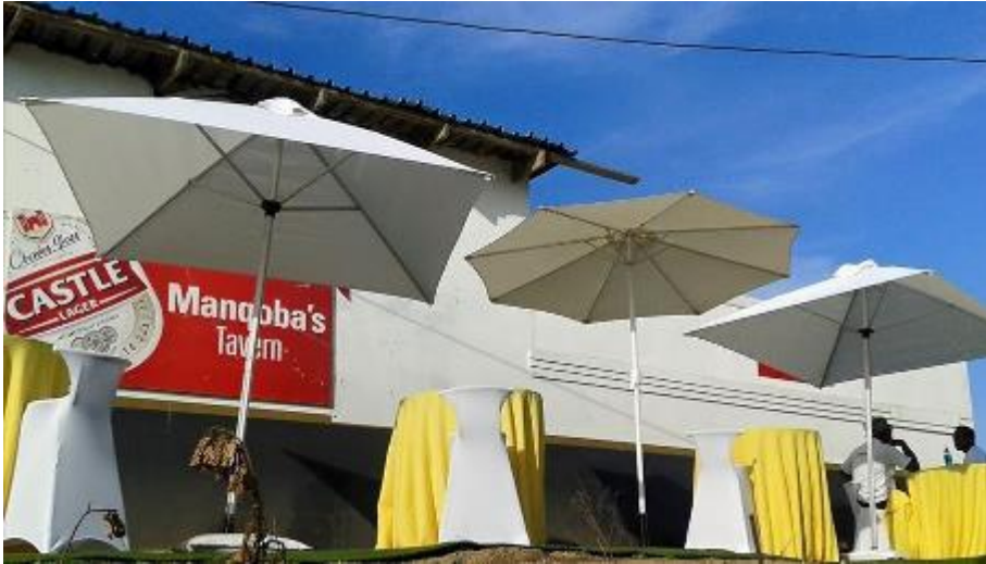
The entrepreneur has various business in retail and a taxi business.