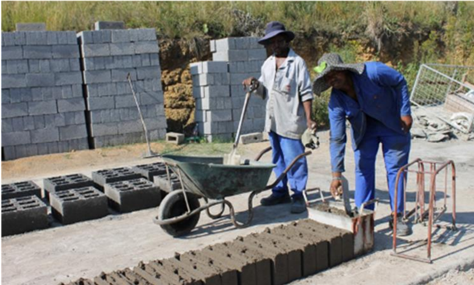
Block-making at Akubesiyezuka's premises in Folweni, eThekweni