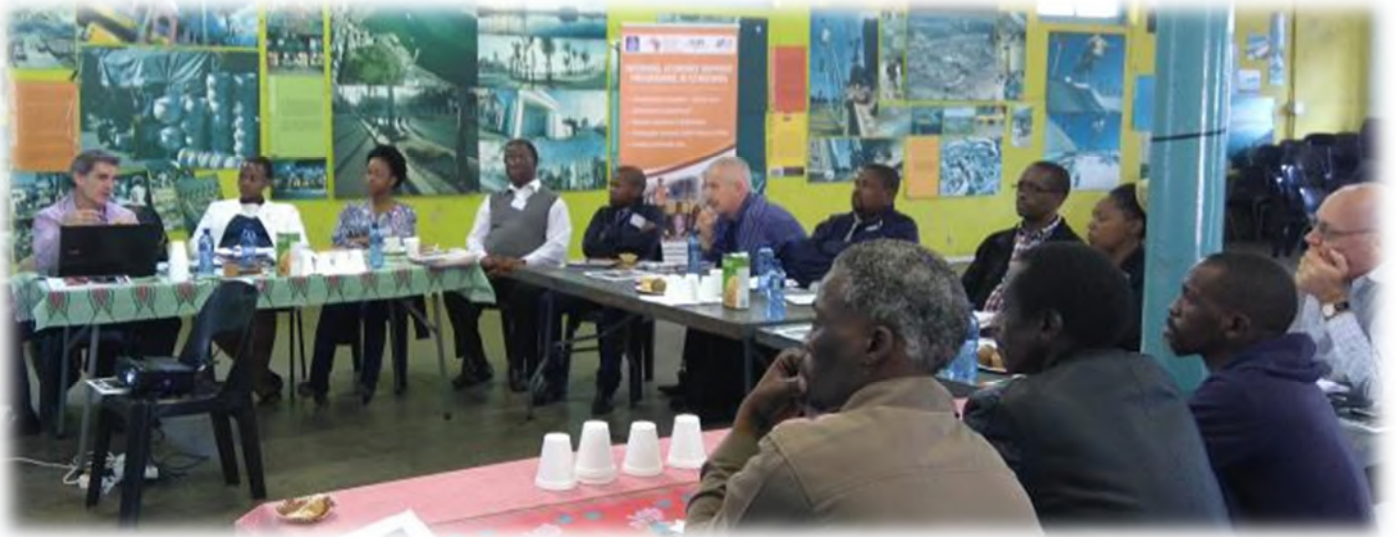
Participants at the 2015 Roundtable: Unlocking sustainable economic growth in the informal economy