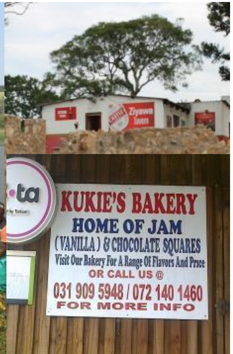
Left: Zukula/ Sikhakhane employees at work. Right (top): Ziyawa Shisanyama Right (below): Signage for Kukie's Bakery. Images below from IESP Participation Awards 2016.