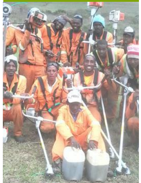
Makholeka Trading cc employees