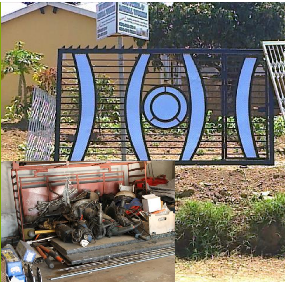
Typical product (gate), tools and storage facilities found at informal steel enterprises

From inception to date the IESP has assisted in: A business development plan; provided Isiqalo (basic business skills training); linked the steel manufacturing enterprises in the IESP programme to discuss challenges and find collective solutions that will benefit all the steel businesses and advised Nhlanhla to approach eThekweni and re-install signage for advertising the enterprise.