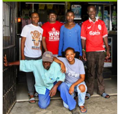
These business are located in Inanda and a third business in Pietermaritzburg.

There potential for additional job creation is high, provided that the entrepreneur acquires a license to establish a bottle store in the current property and subsequently develops a VIP lounge