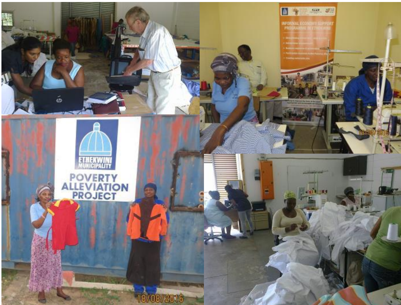
Collage of photographs of the textile micro and informal enterprises taken at IESP site visits to Zamukuphila, Green Door and JPN.