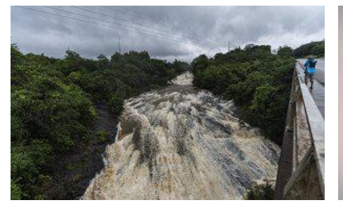
STORM AFTERMATH: Tropical Cyclone Eloise wreaks havoc, but rainfall brings some relief

(https://www.dailymaverick.co.za/article/2021-01-28-farewell-iqbalmaster-hero-doctor-and-aglobal-expert-on-thetreatment-of-drugresistant-tb)