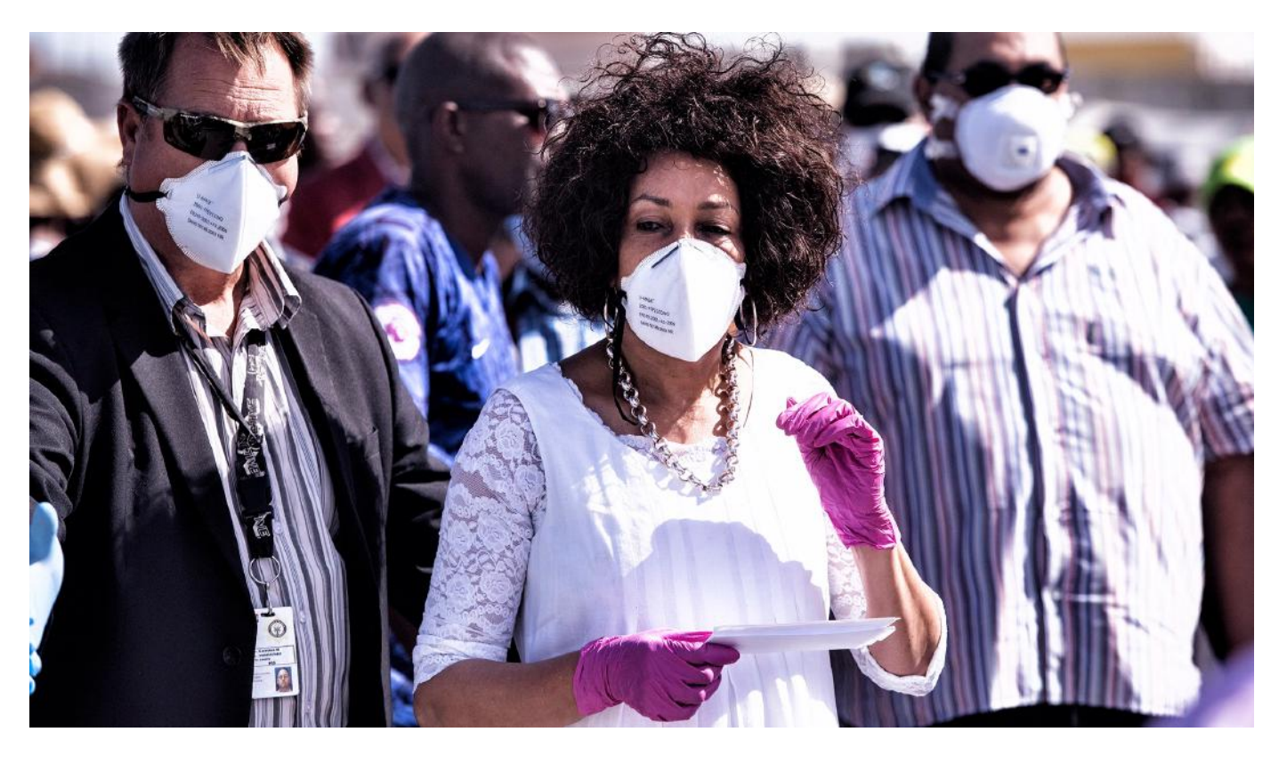
Dinister of Human Settlements, Water and Sanitation Lindiwe Sisulu visits Empolweni community in Khayelitsh...

By Daily Maverick Staff Writer • 20 April 2020