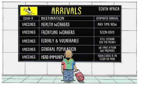
Business Maverick: CartoonDAYS OF ZONDO: SecretTuesday by Ricobillions poured into State(https://www.dailymaverick.Soczar/tartigle/202sustain and01-25-cartoon-tuesday-by-protect 'Zuma...rico-4)(https://www.dailymaverict)

(https://www.dailymaverick.co.za/article/2021-01-28-mboweni-sacks-entire-irbaboard-throwing-the-audit-watchdog-into-another-governance-crisis/? utm_source=top_articles_poc)