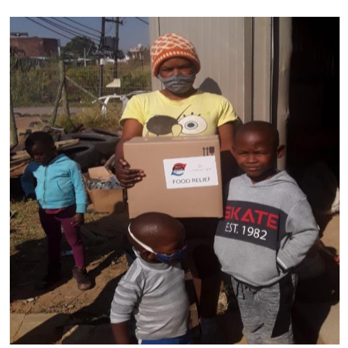
Waiting to distribute food boxes in Bhambayi