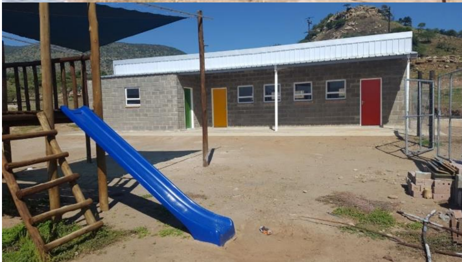
Ngqongeni Crèche for 40 children, Msinga