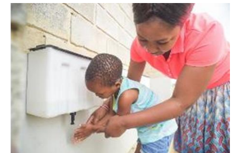
Ngqongeni Crèche – ablution facilities