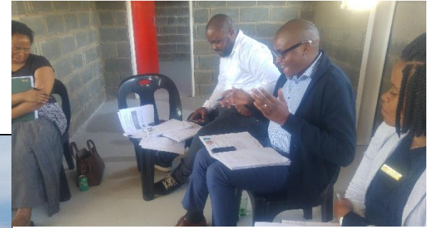
On- site meeting with Umzinyathi ECD Project Steering Committee