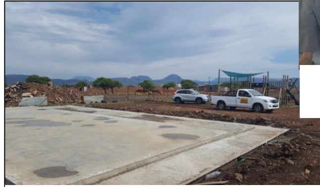
Vukuzakhe ECD centre slab