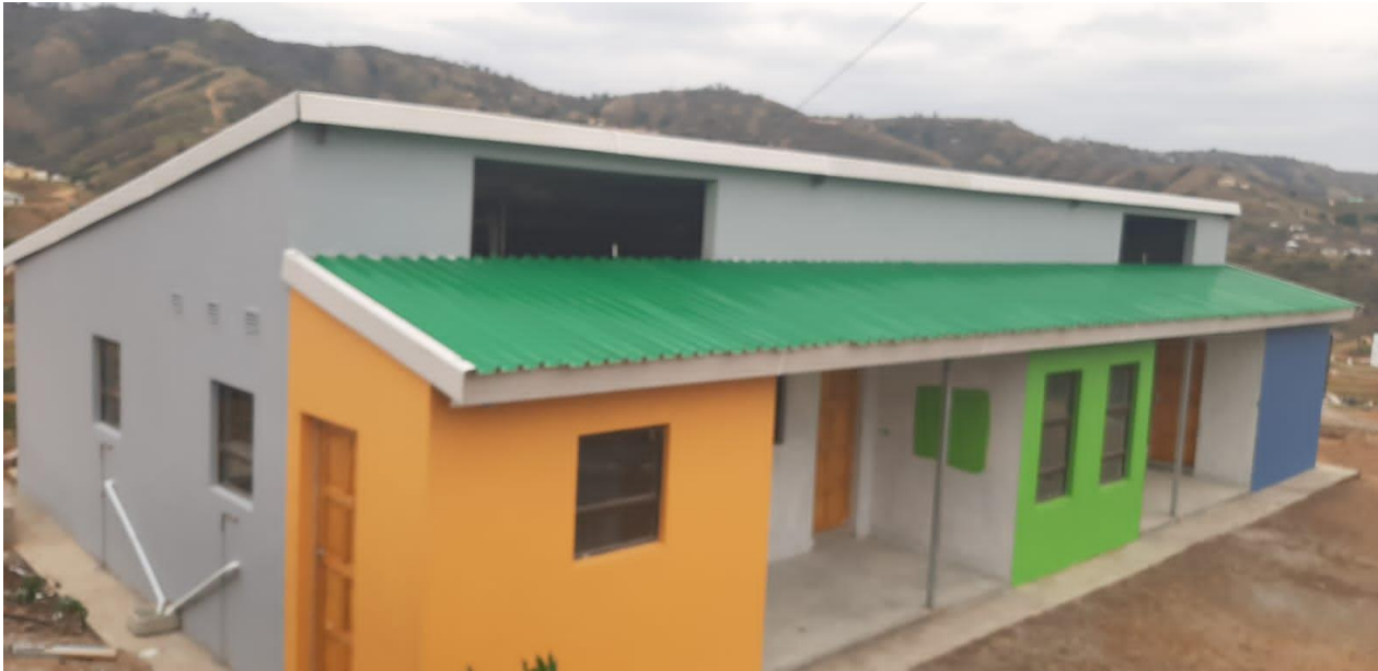
KZN DSD: ECD centre in Richmond inspired by the affordable designs

The Strategic ECD Infrastructure Support (SEIS) Programme brought about a possible change in government's design and specification philosophies to optimise limited funding providing maximum access to affordable ECD centres.