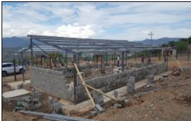
Ngqongeni Crèche under construction, Msinga